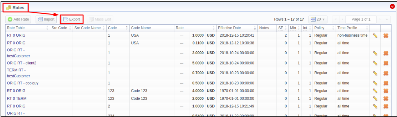
Screenshot: Rates export button

You can use the same advanced search tool, as provided on the Rates tab, to choose which rates you would like to export (including all , past , current , future , or current/future ) prior to actually doing it. After clicking a respective button, the following settings will be visible: